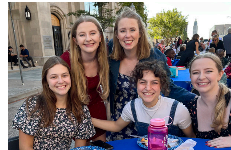
NextGen continued next page.